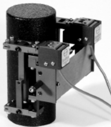
Model 3442RA1 with 50 mm gage length and 1.25 mm measuring range. Shown on 30 mm diameter test sample.

With gage lengths of 1 and 2 inches (25 and 50 mm) and measuring ranges of 0.050 and 0.100 inches (1.2 and 2.5 mm), the Model 3442RA1 was designed for applications where compressive strength tests on small rock, concrete and other small compression samples is desired.