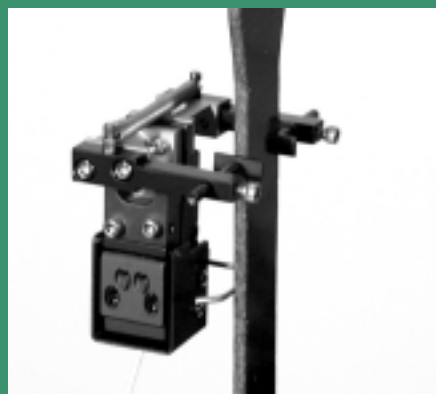
3475 with ±1 mm measuring range.