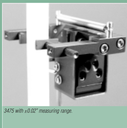
3475 with ±0.02" measuring range.