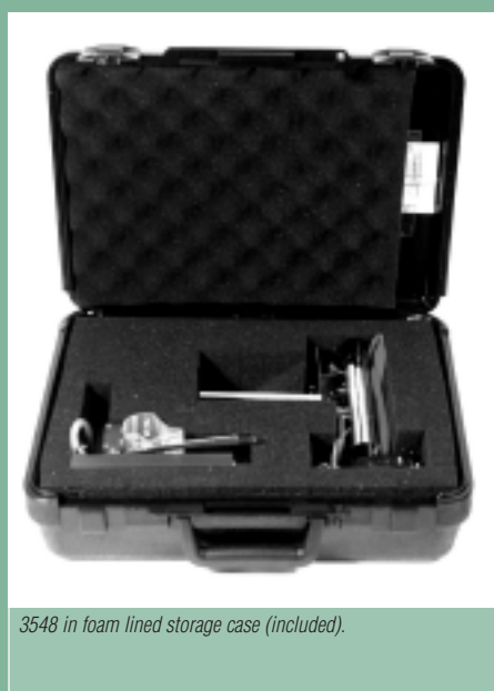
3548 in foam lined storage case (included).

The Model 3548 extensometers are strain gaged devices, making them compatible with any electronics designed for strain gaged transducers. Most often they are connected to a test machine controller. The signal conditioning electronics for the extensometer is typically included with the test machine controller or may often be added. In this case the extensometer is shipped with the proper connector and wiring to plug directly into the electronics. For systems lacking the required electronics, Epsilon can provide a variety of solutions, allowing the extensometer output to be connected to data acquisition boards, chart recorders or other equipment. See the electronics section of this catalog for available signal conditioners and strain meters.