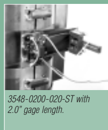
3548-0200-020-ST with 2.0" gage length.