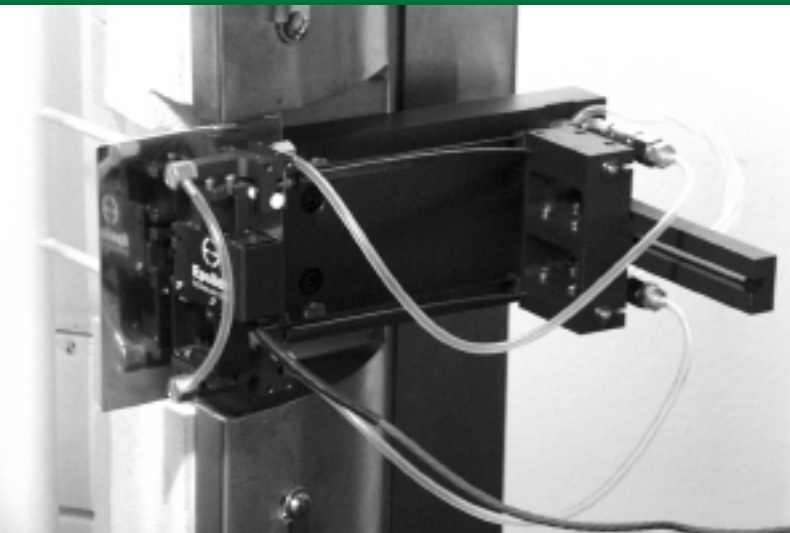
3548 with an open furnace showing specimen engagement.

High temperature extensometers for use in split type materials testing furnaces. Water-cooled and furnace bracket mounted, these are for use to 1200 °C (2200 °F). The high temperature option allows use to 1600 °C (2900 °F).