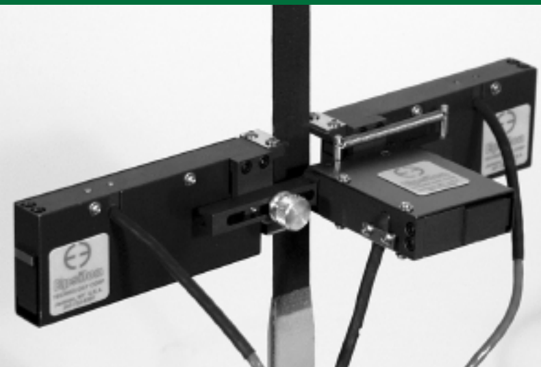
3560 with 25 mm gage length and ±5% axial strain and ±1 mm transverse range.

A single integral unit provides simultaneous lateral (transverse) strain and averaged axial strain measurement. The unit is also available as an averaged axial extensometer alone.