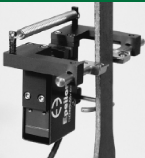
3575 with ±1 mm measuring range.

Designed for general purpose transverse or diametral