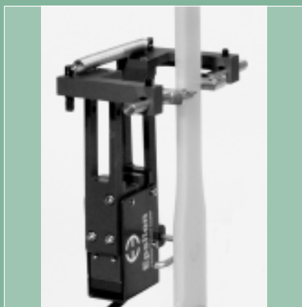
3575 with ±5 mm measuring range.

These units easily clip onto the sample, held in place with an integral spring. Rounded contact edges maintain the position on the specimen. All are high accuracy strain gaged units, compatible with most test controllers.