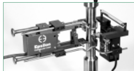
3575 transverse used simultaneously with 3542 axial model.

An alternative unit with dual lateral measurements is the Model 3575AVG, which averages transverse readings over two locations. (See page 38.)