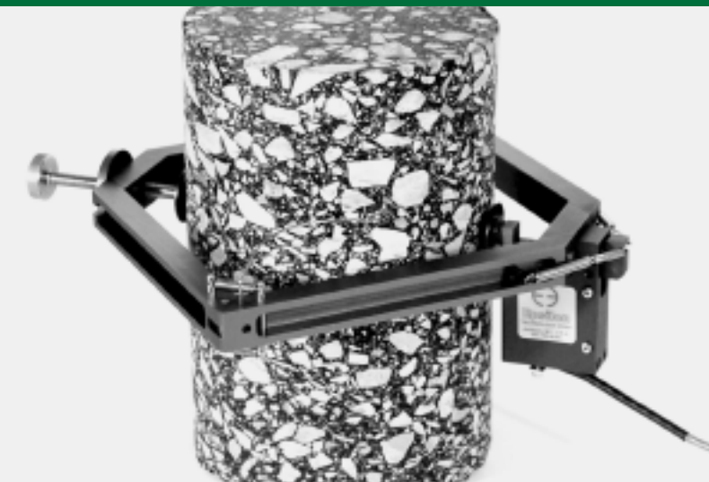
Model 3975 diametral extensometer

This extensometer was designed for accurate measurement of small diametral strains such as those required to determine Poisson's ratio of rock, concrete and asphalt samples. The units are designed to be used in conjunction with the Model 3542RA axial averaging extensometer.