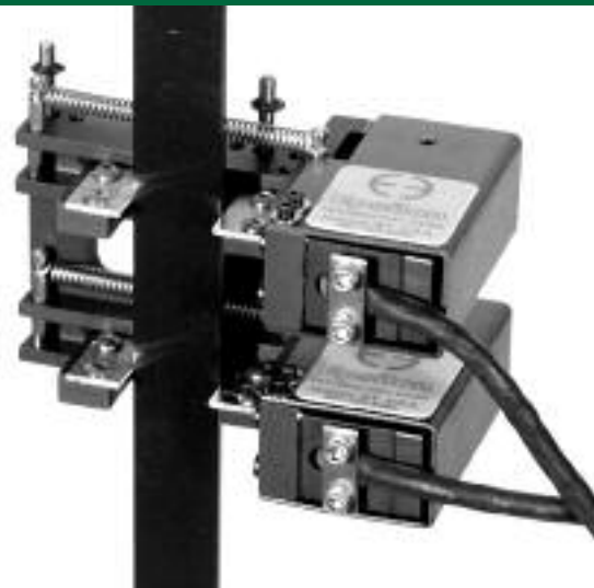
3575AVG model on sheet metal sample.

Designed for measuring r-values in sheet metal testing, this extensometer averages the lateral strain at two locations. This model may be used simultaneously with the Model 3542 axial extensometer.