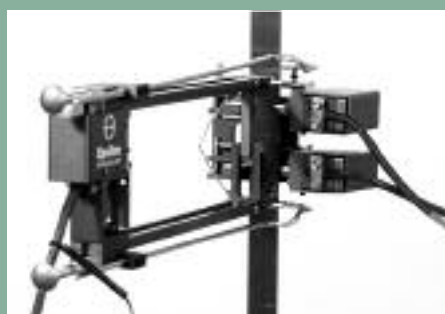
3575AVG used simultaneously with Model 3542 axial extensometer.

Designed for measuring r-values in sheet metal testing, this extensometer averages the lateral strain at two locations. This model may be used simultaneously with the Model 3542 axial extensometer.