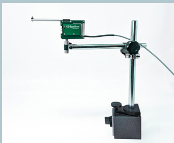
Model 3540 with included magnetic mounting base