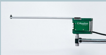
Model 3540 with 25 mm measuring range