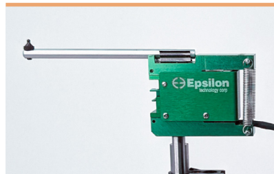
Model 3540 with 4 mm measuring range

Widely used for measuring deformations in three- and four-point bend tests, compression tests and a variety of general-purpose deflection measurements. These strain gaged devices come with a magnetic base for easy mounting.