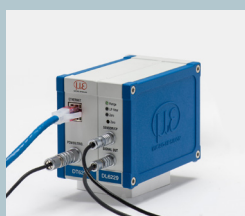
Model DT6229 single-channel signal conditioner provides analog and digital outputs