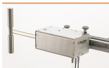
Model 7650A axial extensometer

This high precision extensometer measures axial strains on specimens at temperatures up to 1600 °C (2900 °F). Compatible with materials testing furnaces or induction heating. May be used for strain-controlled, high frequency fatigue tests. Slide mounting system enables mounting to hot specimens in seconds.