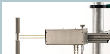
Model 7650A extensometer with rigid load frame mounting

The Model 7650A is often customized for specific test needs. Contact Epsilon for a configuration that matches your requirement.