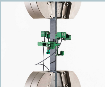
Model 3442AVG extensometer 3442-050M-025M-ST

See the electronics section of this catalog for available signal conditioners and strain meters.