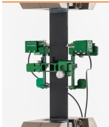
Model 3442AVG-050M-025M-ST with 50 mm gauge length and +2.5 mm/-1.0 mm measuring range

This all-purpose averaging axial extensometer is used in tension or compression to measure Young's modulus, offset yield, and strain to failure. It is compact and lightweight. Gauge length is set automatically for fast specimen mounting.