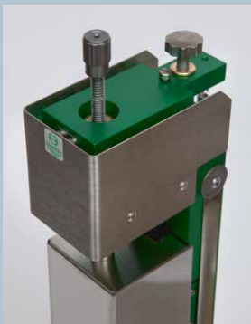
Coarse and fine adjustment knobs for fast and accurate positioning

A wide range of adapters are available to allow use with axial, transverse, shear, and many other specialized extensometers. The calibrator comes with round adapters (9.52 mm [0.375 inches] diameter) that work with many typical axial extensometers. Specialized adapters are available. For very long gauge length extensometers, optional extension posts are available.