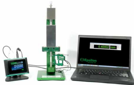
Model 3590VHR calibrator with included Touch Display digital readout and software (computer optional)

The 3590VHR calibrator has the high resolution and accuracy required to calibrate and verify extensometers to ASTM E83 Class B-1 and to ISO 9513 Class 0,5. The 3590VHR's resolution is 20 nanometers.