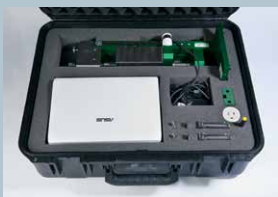
Model 3590VHR calibrator storage case

▶ See the Model 3590VHR extensometer videos