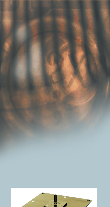
Model 3910 gluing template

Designed for asphalt core testing applications with core samples having 100 and 150 mm (4 and 6 inch) diameters. The unit meets test method requirements for strain measurement developed under the U.S. Federal Highways SHRP program.