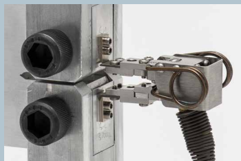
Model 7641 COD gage

See the electronics section of this catalog for available signal conditioners and strain meters.