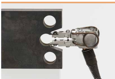
Model 7641 COD gage

These capacitive sensors may be used up to 700 °C (1300 °F) without any cooling.