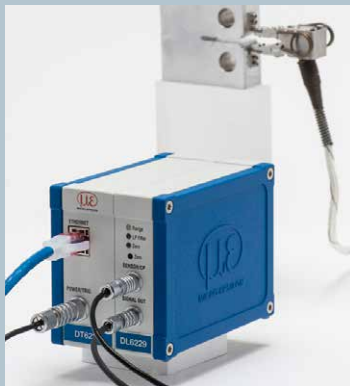
Model 7641 COD gage with signal conditioner