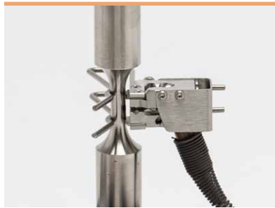
Model 7642-010M-025M extensometer

For use in environmental chambers where the entire extensometer must be exposed to elevated temperatures. These capacitive extensometers may be used up to 700 °C (1300 °F) without any cooling.