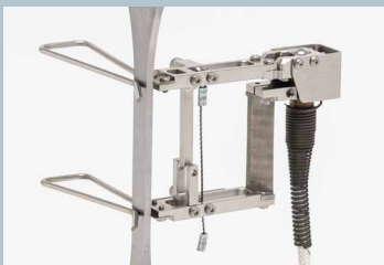
Model 7642-050M-125M extensometer

The 7642 is readily interfaced with most existing test controllers, and may be directly connected to a data acquisition system or chart recorder, or directly to a PC. The 7642 may be used for strain controlled tests such as low cycle fatigue (LCF).