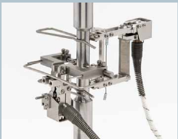
Models 7642 and 7675 extensometers