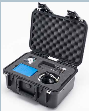
Models 7642 and 7675 extensometers