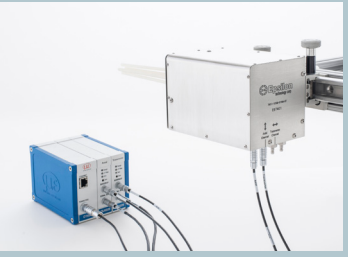
Model 7651 extensometer with two-channel Model DT6229 signal conditioner