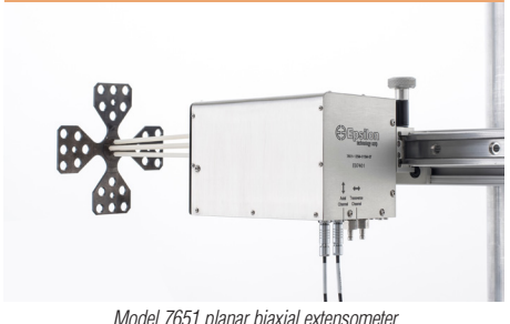
Model 7651 planar biaxial extensometer with tension-tension specimen

Simultaneously measures in-plane bi-axial strains at high temperatures on specimens tested in X-Y bi-axial machines. For use with materials testing furnaces or induction heating up to 1600 °C (2900 °F). May be used for bi-axial strain controlled fatigue. Slide mounting system enables mounting to hot specimens in seconds.