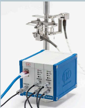
Model 7675 and 7642 with DT6229-02 (dual channel) signal conditioner