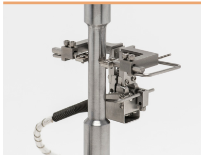
Model 7675 transverse extensometer

Designed for transverse or diametral strain measurement in environmental chambers where the entire extensometer must be exposed to elevated temperatures. These capacitive extensometers may be used up to 700 °C (1300 °F) without any cooling.