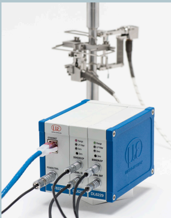
Model 7675 and 7642 with DT6229-02 (dual channel) signal conditioner

The 7675 is supplied with the advanced DT6229 controller. The standard output is 0-10VDC analog signal, factory calibrated with the extensometer. This system provides a number of functional enhancements, including high speed digital output, built in calibration and tare functions, analog and digital filters, and more.