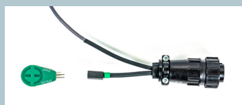
Epsilon Shunt Calibration System

Contact Epsilon about recalibration and Epsilon Shunt Calibration System retrofits.